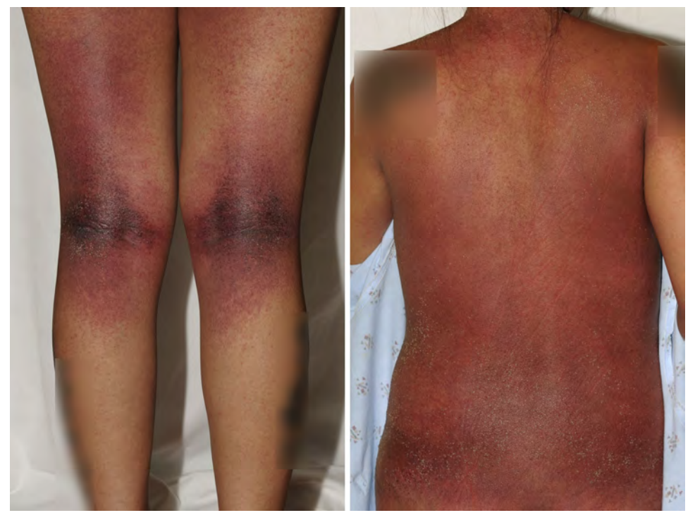
Fig 2. Accentuation in the skin folds including the waistline, intergluteal cleft, and popliteal fossae.